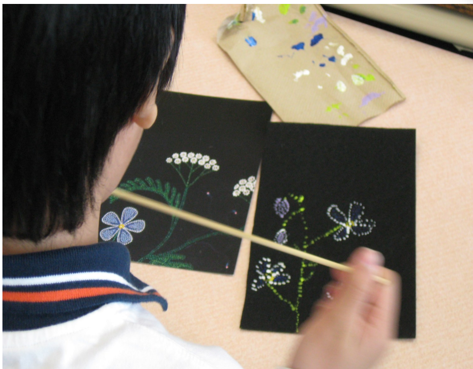
Métis Flower Dot Artwork